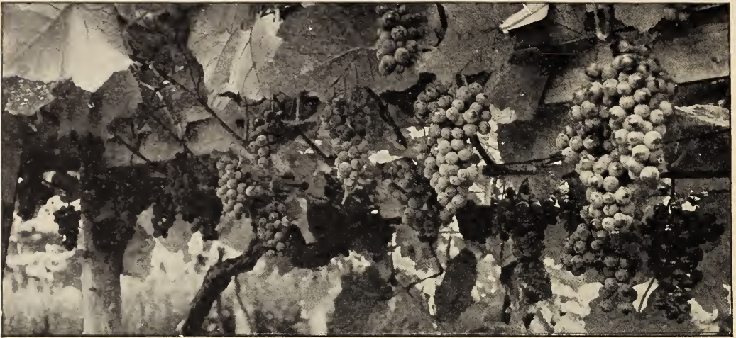
A thrifty Grape-vine